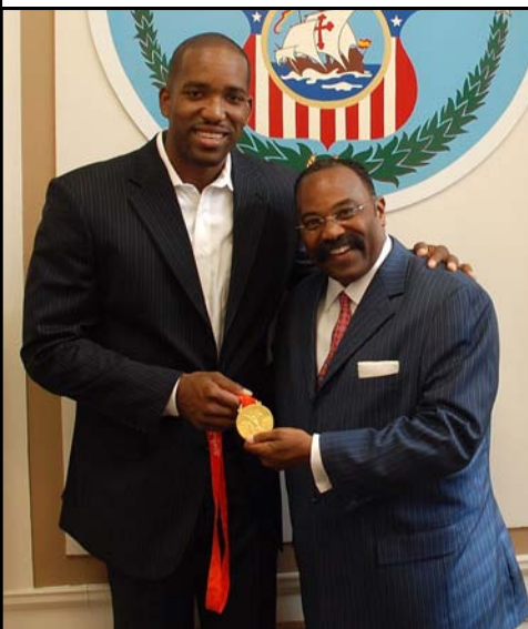
Michael Redd, leader of the Michael Redd Foundation, was honored By Columbus City Council for his 2008 Olympic Gold Medal in basketball, as well as his community service work.