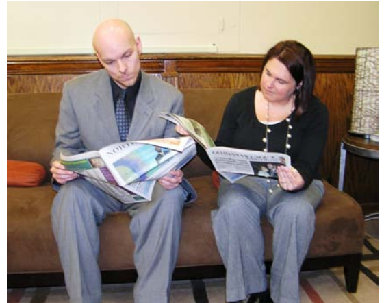
Two residents enjoy catching up on community news.

On December 14, I was pleased to sponsor legislation that clarified Columbus City Code to address unauthorized removal of free print publications from distribution locations in Columbus. Prior to the passage of ordinance 1409-2009, which was voted on unanimously by City Council and signed into law by Mayor Coleman, our city code was ambiguous on the theft of newspapers that are distributed free of charge. By making theft of free print publications illegal, police and prosecutors will have the necessary laws in place when they are called regarding these thefts. Existing provisions within the Columbus City Code already addressed cases involving the theft of paid publications.