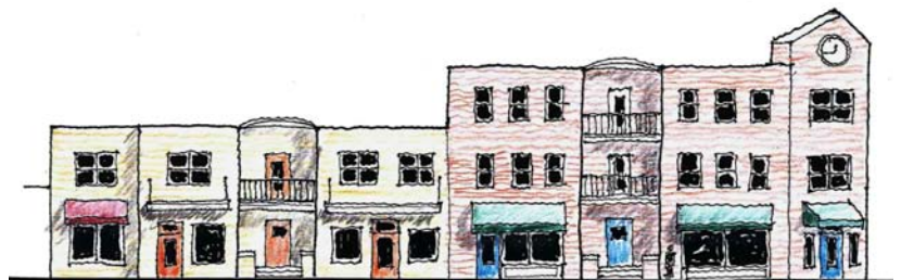
DRAFT Development Concept for the northwest corner of W Broad and Powell

It is important to note that the Plan Amendment will not be addressing safety or transportation issues. Transportation issues will be addressed by the Hilltop Mobility Plan and as a long term plan, it cannot address immediate needs such as neighborhood services or code enforcement